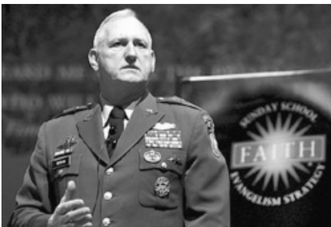
National Faith Institute/Kent Harville